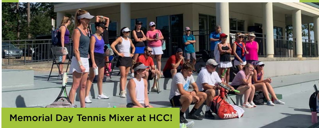
Memorial Day Tennis Mixer at HCC!

*All adult drills are $20 for members and $30 for non-members.